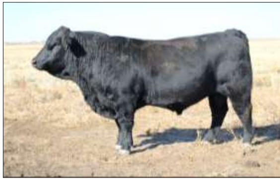
TRRH RRR Nightforce B30