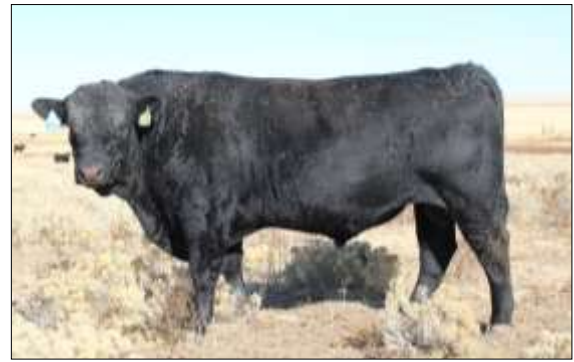
HRM Shear Force B54

While most reference sires are from bull studs and used AI, we also have two outstanding reference sires located in our home pasture. You're welcome to come by and see them in-person.